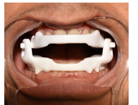
Efficient, lightweight, comfortable, durable and customisable to patient needs