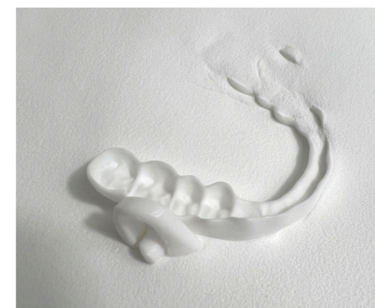
Made of Polyamide 12, certified for biocompatibility Class IIa